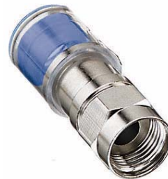
89-044 RG-6 OmniConn™