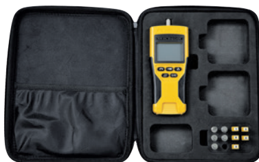
(Products not included)