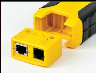
Self Storing Remote