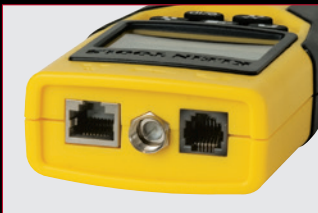
RJ45, F-Connector and RJ11/12 Jacks