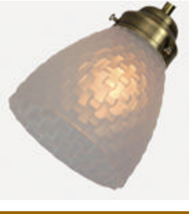
-174 GLASS-Straight Bell with Frost Basket Weave Finish.