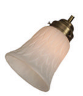
-131 GLASS-Feather Bell with Sand Textured Finish.