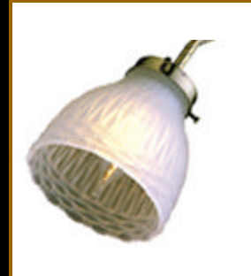
-155 GLASS-Bamboo Bell with White Hand-Etched Oval Finish.