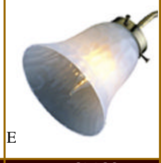
-156 GLASS-Bell with Ripple Frost Finish.