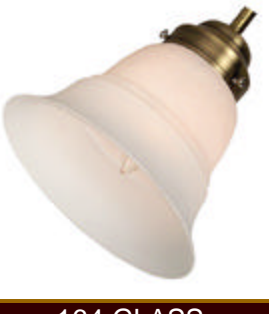
-164 GLASS-Step Bell with Sanded Frost Finish.