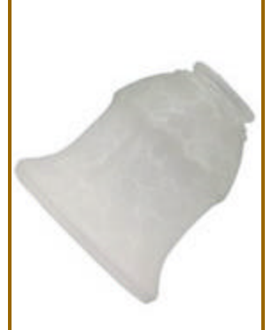
-103 GLASS-Flair Bell with Frost Veined Finish. Emperor Glass

The \ {\it Frost Collection illuminates} \ a \ {\it soft subtle glow} throught a room. Intricate patterns adorn each piece of glass to give this collection a feel of its own.