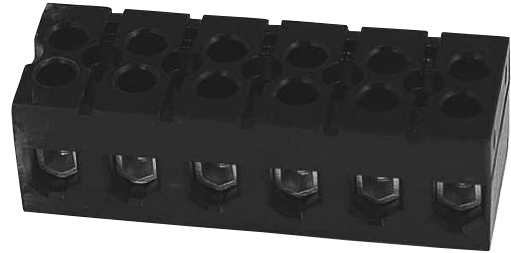
985 GP 06