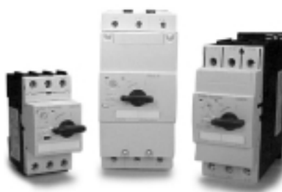
Type A307, A308 and A309