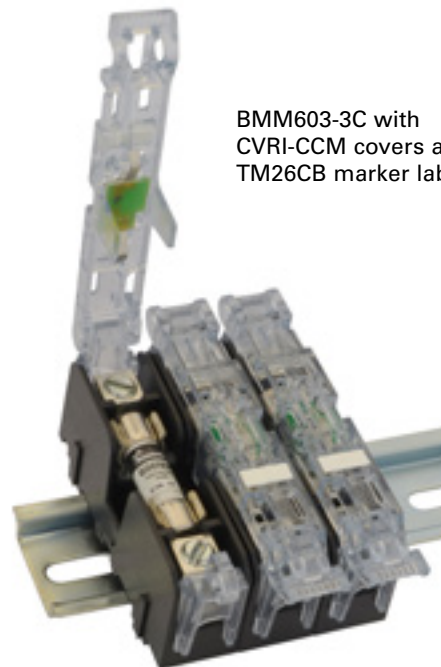
BMM603-3C with CVRI-CCM covers and TM26CB marker labels

Eaton, Bussmann, Limitron and Low-Peak are valuable trademarks of Eaton in the US and other countries. You are not permitted to use the Eaton trademarks without prior written consent of Eaton.