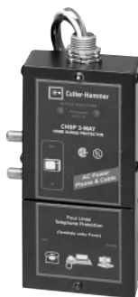
CHSP (Cutler-Hammer Home Surge Protector)