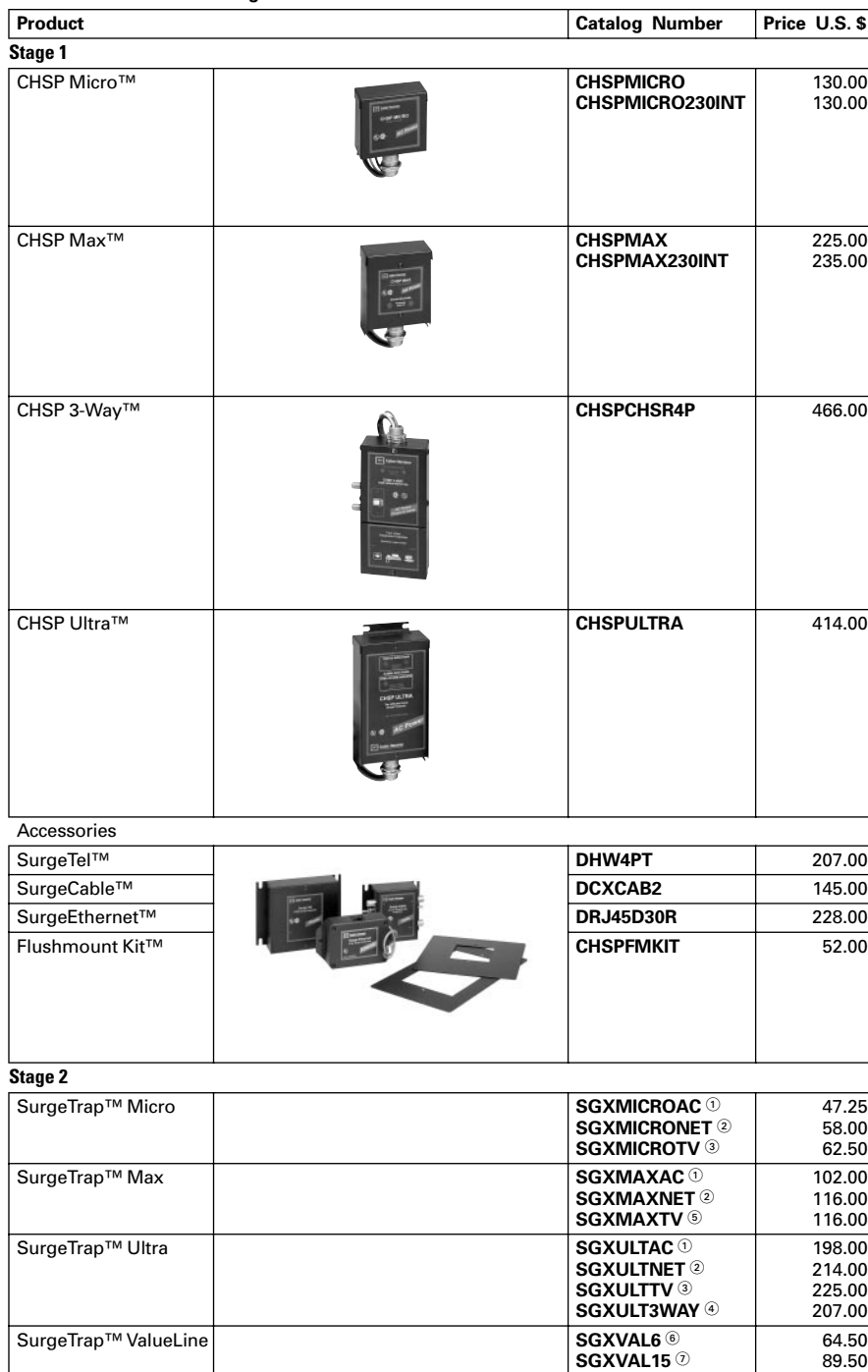
Table 3-36. Residential Surge Products

For more information, see surge Section 10.