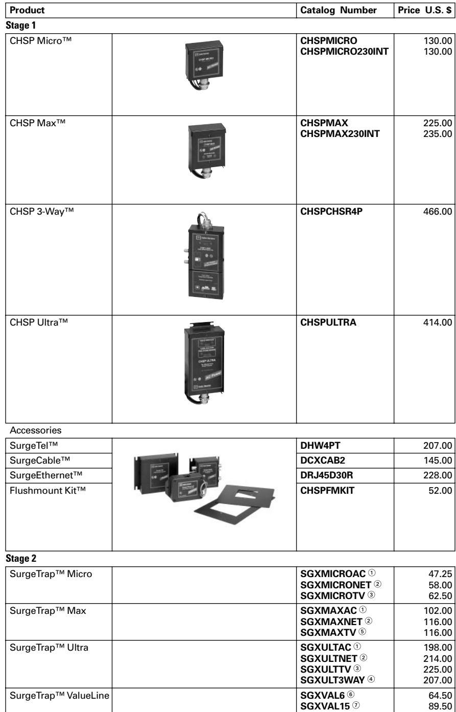
Table 3-36. Residential Surge Products

For more information, see surge Section 10.