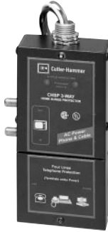
CHSP (Cutler-Hammer Home Surge Protector)