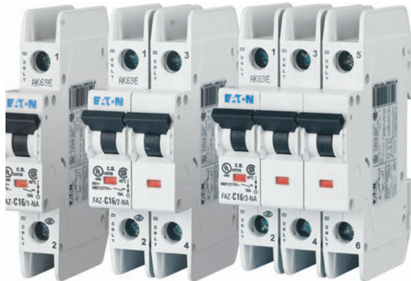
Optimum and Efficient Protection for Every Application