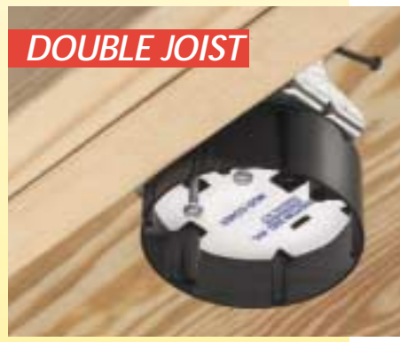
...for a UL/CSA Listed Installation of Fans/Fixtures up to 70 lbs!

Check out our complete line of fan/fixture boxes. We have a product that fits most applications or jobsite conditions!