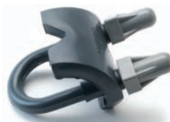
Right Angle Beam Clamp