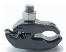
Parallel Beam Clamp