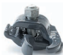
Edge Beam Clamp