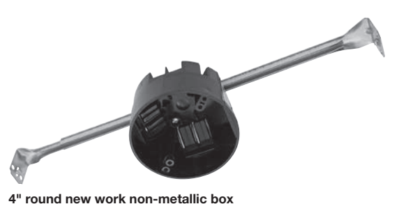
with hanger bar assembly 4" diameter x 2-3/16" (102mm x 56mm)

Surface mounting in a fire-rated ceiling using an appropriate electrical box offers a cost-effective alternative to fire-rated recessed housings. Note : Fire-rating is per the rating of the ceiling and applicable junction box, not the SLD.