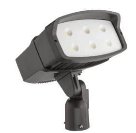
IS- Slipfitter Mount