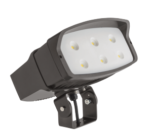
YK- Yoke Mount