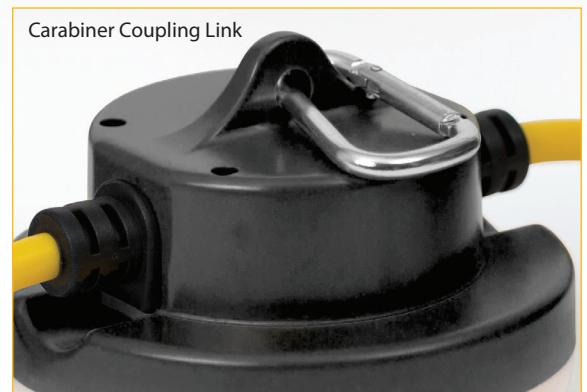
Carabiner Coupling Link