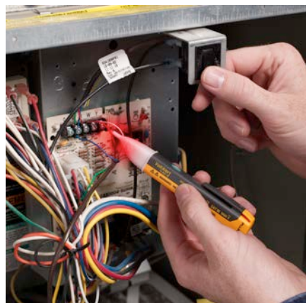
Low volt version

Fluke. Keeping your world up and running.®