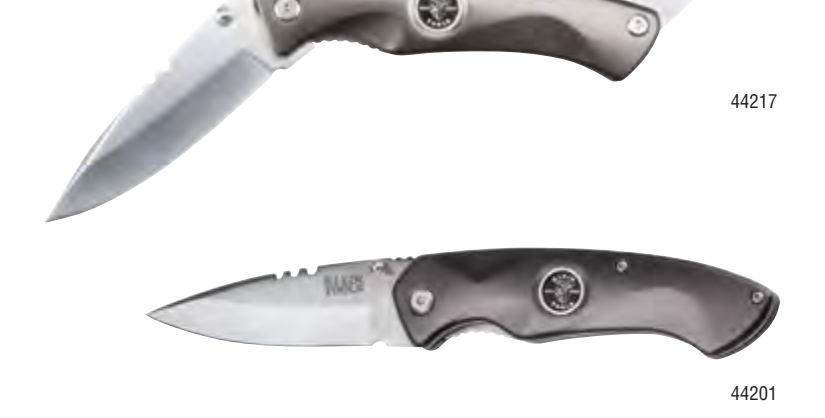
Features stripping notches