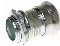
Uninsulated Connectors Steel