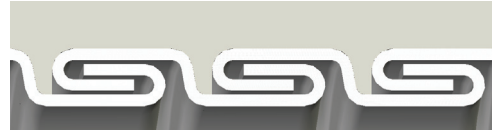
Interlocked Design 1-1/2" through 4" with no bonding wire