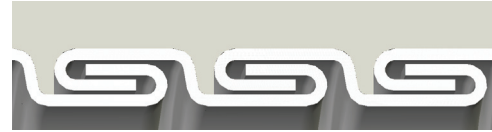
Interlocked Design 1-1/2" through 4"