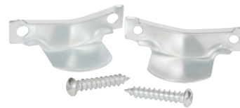
Strain Relief Clamp