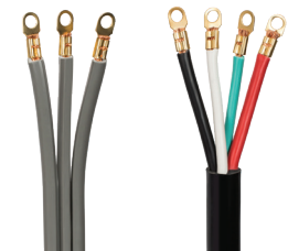
Heavy-Duty Ring Terminals