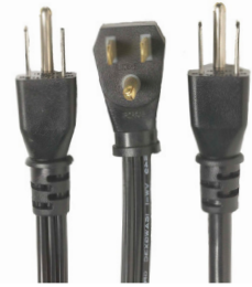
Power/Appliance Replacement Cords

Meets the requirements of the 2023 National Electrical Code: Articles 422.16(A)(1) and (2).