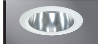
5107SC Specular Reflector, White Trim

*UL1993 listed LED & CFL equivalent lamps permitted. Consult lamp manufacturer for conditions of use. Cooper Lighting Solutions does not warranty the lamp.