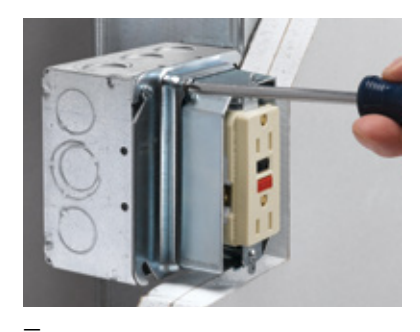
03 Re-tighten... Adjustment screws.