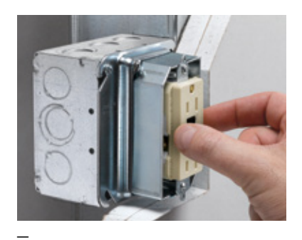
02 Adjust... Inner ring to be flush with wall surface.