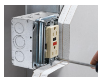
01 Loosen... The 2 adjustment screws located in opposing corners of the mud ring.