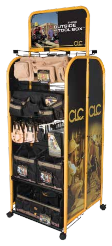
C1092 2' Double Sided Merchandiser