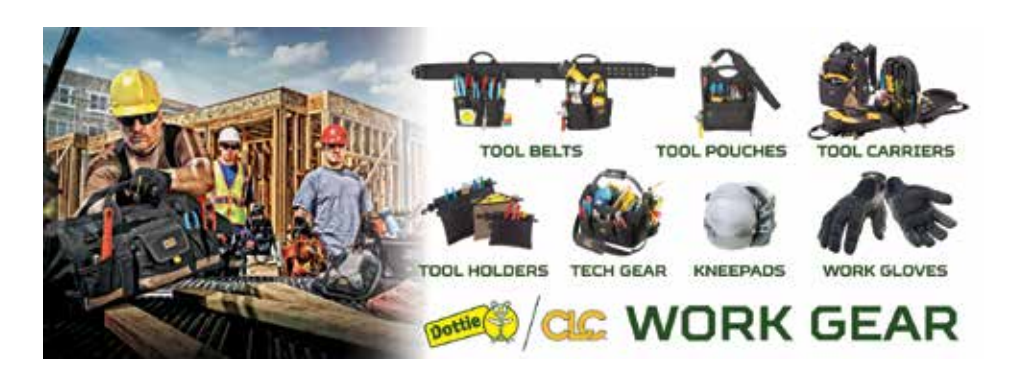
CLCBANNER Showroom Banner 17" x 48"

Gloves, Bags and Accessories are individually packaged with hang tags and informative labels where applicable. Hang tags allow for versatile merchandising on your show room floor. You have the option to hang or place material on modular merchandisers, slatwall or pegboard for an appealing display. Additional merchandising materials are also available upon request.