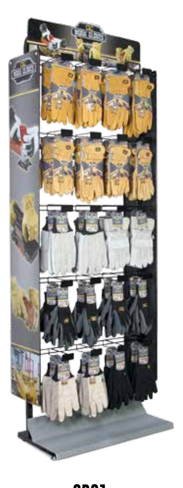
GR01 2' Single Sided Glove Merchandiser