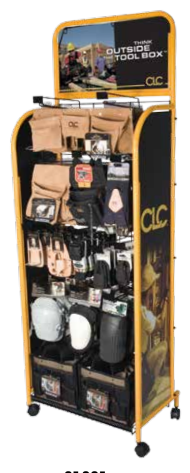
C1091 2' Single Sided Merchandiser