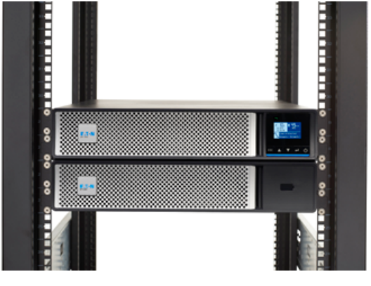
5PX G2 4-post mounting kits are rated (ISTA 3E) to support the weight of a UPS/EBM when mounted in a rack and being transported