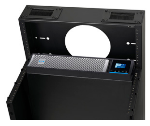
5PX G2 UPS mounted vertically in the MiniRaQ by Eaton, perfect for confined places