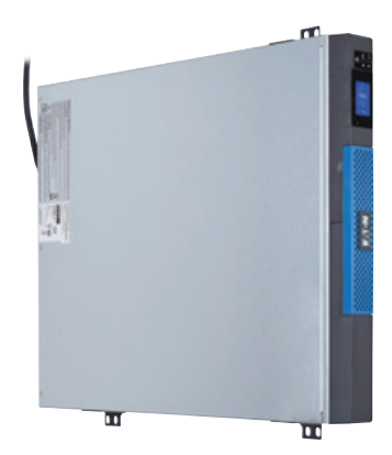
Wallmount: 5P 1500/1550 VA