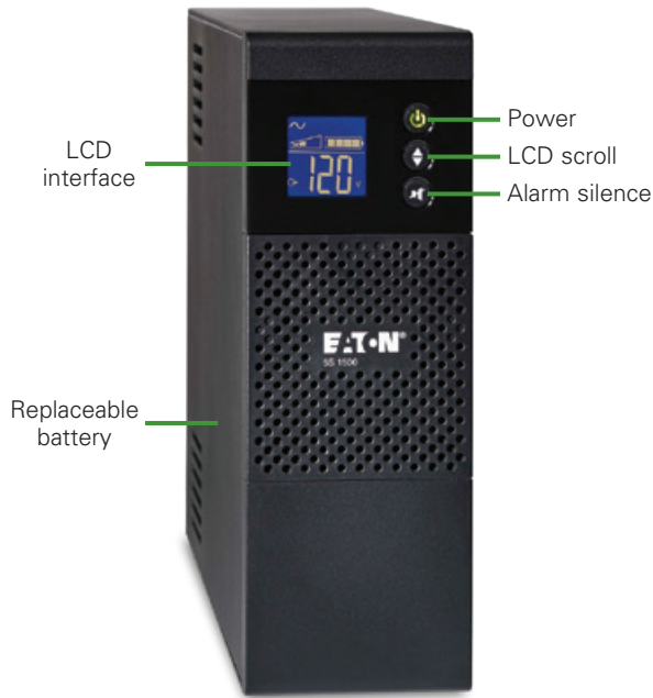
Model displayed above: 5S1500LCD