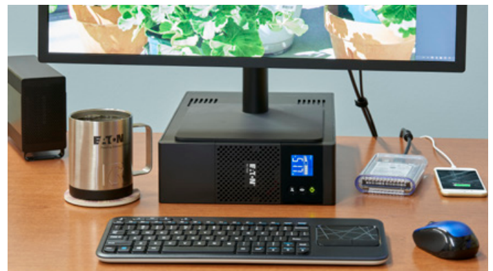
Convenient form factor: use as a desktop monitor stand to fit in confined spaces.