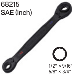
68215 SAE (Inch)