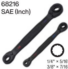
68216 SAE (Inch)

1/4" × 5/16" 1/2" × 9/16" 3/8" × 7/16" 5/8" × 3/4"