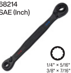
68214 SAE (Inch)

PASS-THROUGH DESIGN for use on extended threaded rods