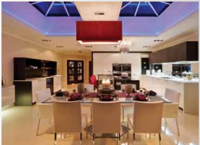
For more information: nteinc.com/led01.pdf nteinc.com/led02.pdf