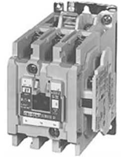
NEMA Size 1 Contactor