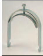
B1532S thru B1564S