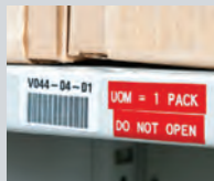
Facility & Safety Identification