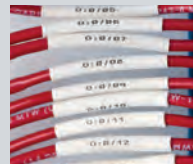
PermaSleeve® Wire Marking Sleeves