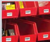
General ID ...and many more!