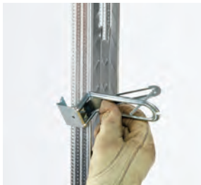
Push Support onto Stud