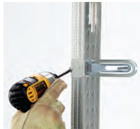
Support stays mounted to stud while securely attached with one screw