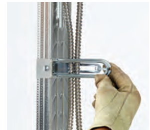
Once cables are inserted, wrap zip-tie around the end of the support to secure the cables

Eaton 1000 Eaton Boulevard Cleveland, OH 44122 United States Eaton.com