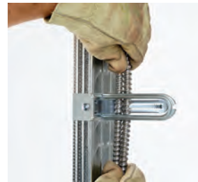
Insert Cables to be secured