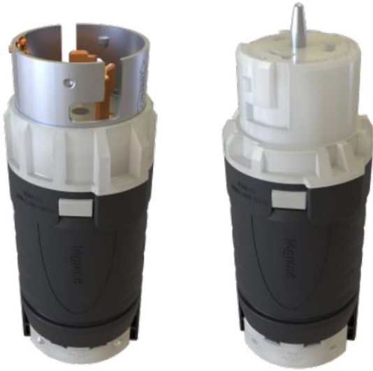
CS6365C Plug & CS6364C Connector