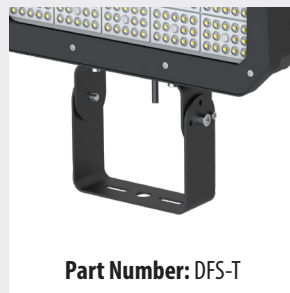
Part Number: DFS-T

Optional trunion mount bolts in place of the slipfitter to mount over a flat surface or overhang. Bolts in using existing hardware.