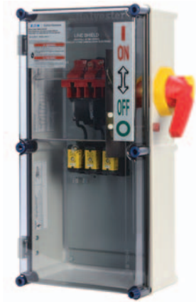
Halyester CUBEFuse Safety Switch with Clear Cover