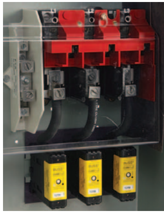
Enhanced Line Shield