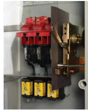
Enhanced Line Shield and Interlock Defeater