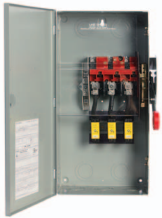
NEMA 1 CUBEFuse Safety Switch