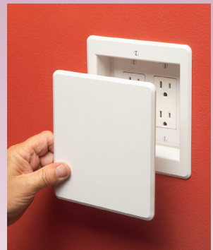
Optional box cover. DVFRC shown.