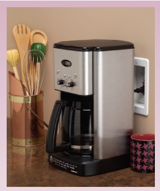
Attractive! DVFR1W shown.