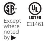
Molded non-metallic junction boxes – 6P rated