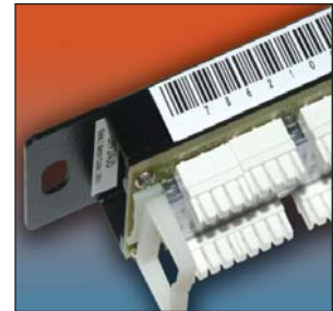
Easy barcode printing!