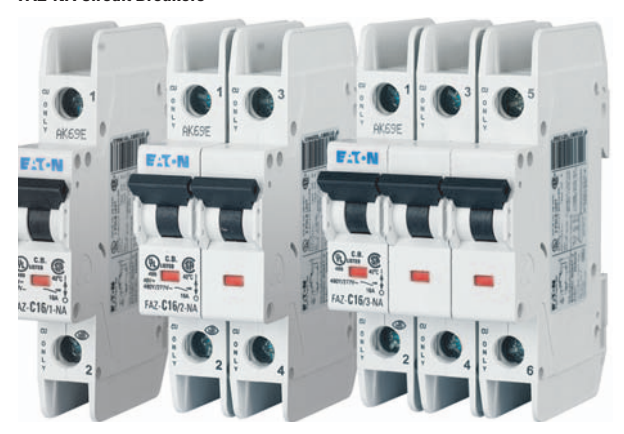
Optimum and Efficient Protection for Every Application