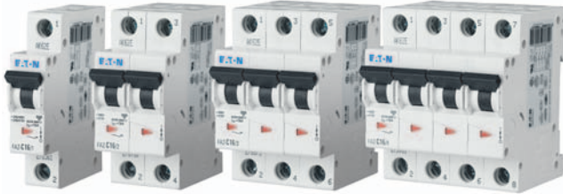
Optimum and Efficient Protection for Every Application