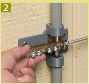
into the lay in lug. Tighten screw.