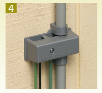
Finish by attaching the cover. Good looks, a great finish.