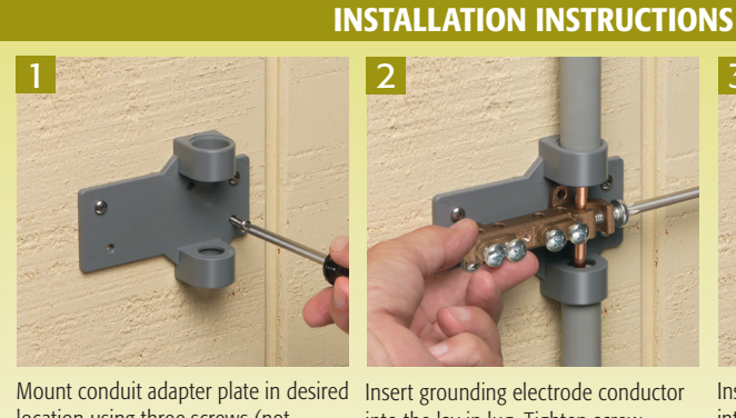
location using three screws (not provided).