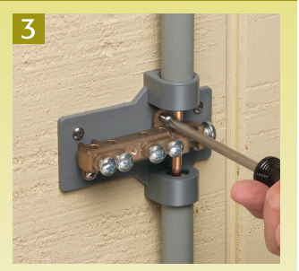
Insert grounding electrode conductor into the lay in lug. Tighten screw.