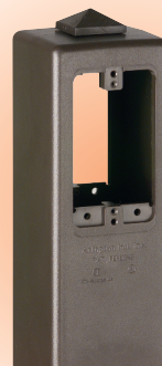
Low voltage separator