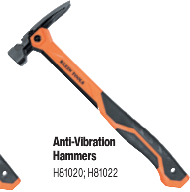
Anti-Vibration Hammers H81020; H81022

DUAL SIDE NAIL PULLERS PULLS NAILS IN TIGHT SPACES