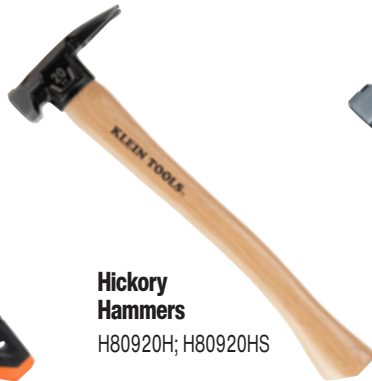
Hickory Hammers H80920H; H80920HS