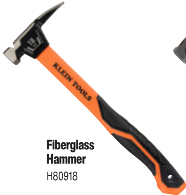
Fiberglass Hammer H80918

Precision-crafted for pulling, prying, and striking