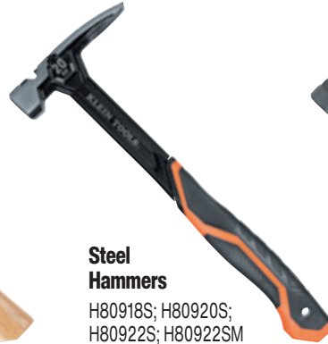
Steel Hammers H80918S; H80920S; H80922S; H80922SM