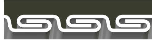
Interlocked Design 1-1/2" through 4"