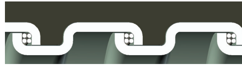
Square-Locked Design with cord packing 3/8" through 1-1/4"