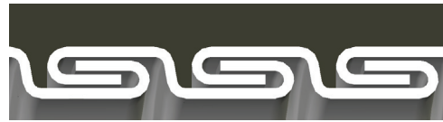
Interlocked Design 1-1/2" through 4"