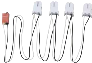
DIRECTDRIVE WIRING HARNESS WITH POWER QUICK DISCONNECT