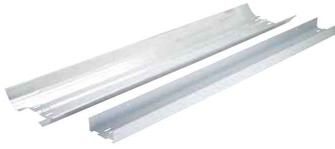
REFLECTOR AND BALLAST COVER