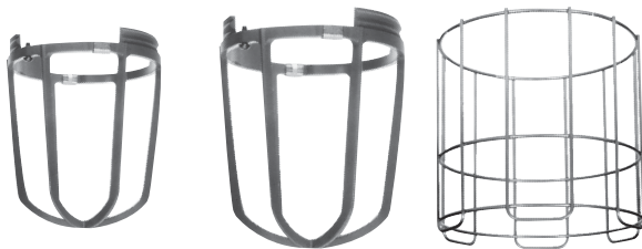
P50 – use with G54 globe P21 – use with G24 globe P33 – use with G303 globe