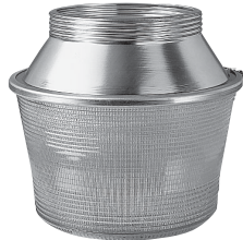
GR302, GR303, GR305