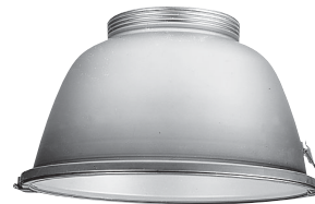
Etched Alzak aluminum reflector/tempered glass lens