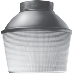
R2, R5, PR2, PR3, PR5