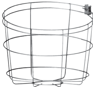
P23 – use with reflectors