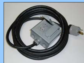
Contractor Convenience Cord Model M10325

Designed for generators up to 7500 watts, this heavy duty, all rubber cord provides a convenient way to use tools or appliances on a jobsite or while camping. Instead of juggling with multiple extension cords, connect this 25 foot cord to the L5-30 receptacle on your generator. Then connect your tools or appliances to the weatherproof box. For 120 volt use only.