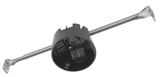
4" round new work non-metallic box with hanger bar assembly 4" diameter x 2-3/16" (102mm x 56mm)

Surface mounting in a fire-rated ceiling using an appropriate electrical box offers a cost-effective alternative to fire-rated recessed housings. Note : Fire-rating is per the rating of the ceiling and applicable junction box, not the SLD.