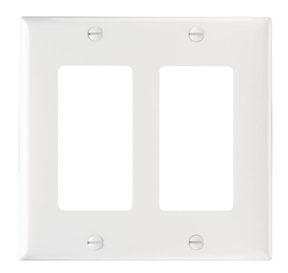
Plate Plastic 2gang 2sierraplex Without Line Ivory