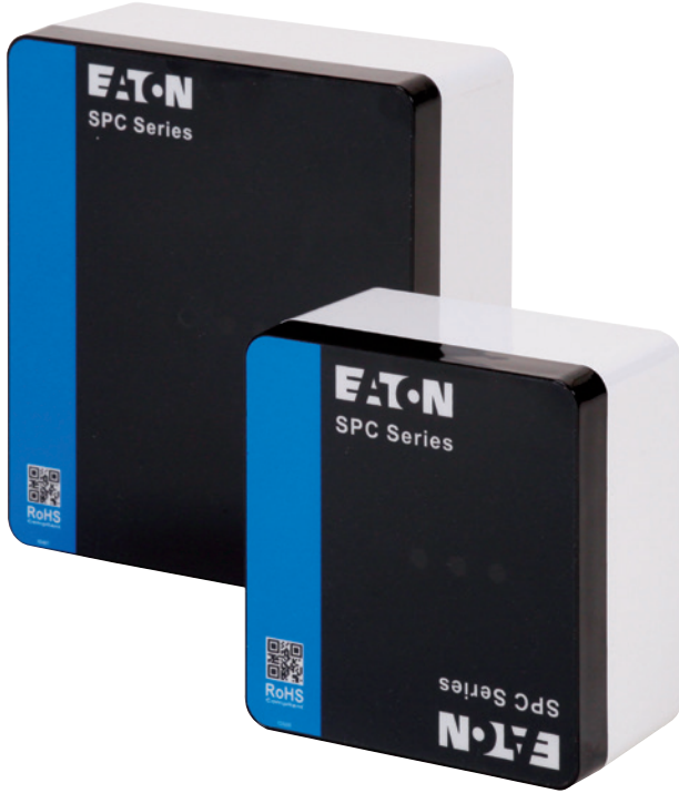
SPC Series surge protective devices.

The SPC Series offers robust protection in a compact, flexible design configurable for a wide range of applications. It meets standard industrial specifications and can be configured based on your specific requirements.