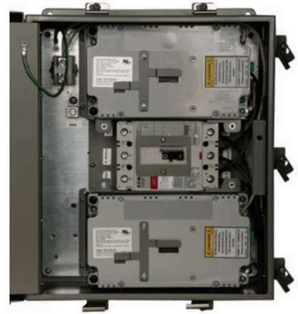
Separate wireways for incoming power cables and surge module wiring allow easy access for installation and flexibility with wire sizes from #10 to 1/0.