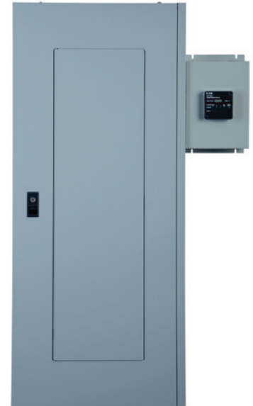
SPD Series side-mount surge protective device providing superior retrofit surge protection.

Regardless of the way the SPD Series device is installed, three feature packages are available: