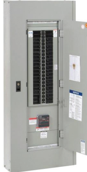
SPD Series unit installed in a panelboard, providing optimum surge protection without the need for an additional enclosure.