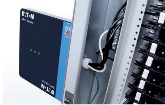
The SPC Series can be easily close-coupled to distribution equipment, keeping the connected lead length short for maximum performance.