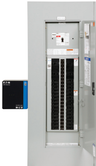
Panelboard with side-mount SPC Series surge protective device.

The SPC Series offers maximum flexibility with configurable features: