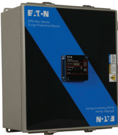
SPM Series surge protective device with patented display technology.