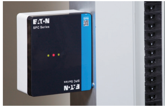
Tri-colored protection status indicators show the results of continuous self-diagnostic testing.