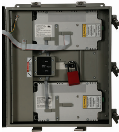
SPM Series devices include industry exclusive barriers and lockout provisions to mitigate arc flash exposure.