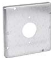
TP724, TP730, TP736