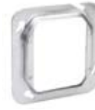
TP584, TP586, TP589, TP593, TP541, TP543