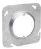
TP569, TP570, TP571 TP573, TP575