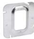
TP574-TP582, TP529, TP531